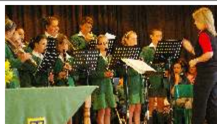
Our Band in action.