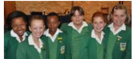
A happy snap after receiving certificates at the Eisteddfod.