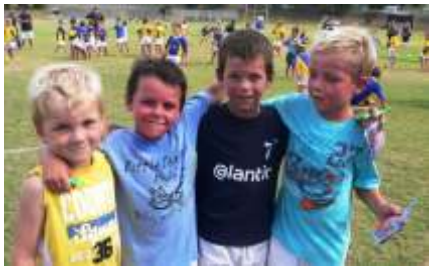
Our Grade 1 Little Legends after their end of term rugby match.